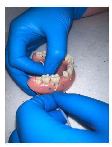
Then, hold the floss tighter in a 'C' shape around each side of the tooth and guide just under the gum line. Finally just pull the floss back through the gap.

You can use the same technique for wider spaces .