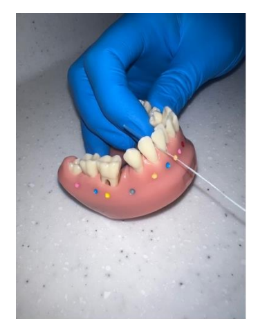
Firstly, thread the stiffened end of the floss through the gap between the teeth.

Please see below an example of how to use the Super Floss: